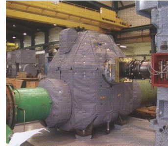
16" x 18" Centrifugal Pump Design: LT450A-TT-1.5" Thick 6.0dBA Reduction

Blanket construction shall be a double sewn lock stitch with a minimum of 7 stitches per inch. Raw jacket edges will have a tri-fold PTFE Teflon® cloth binding. No raw cut jacket edge will be exposed. Stitching will be done with pure Teflon® thread.