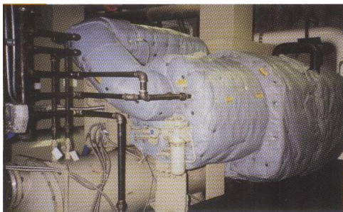
Rotary Screw Liquid Chiller Design: LT450A-TT-2.5" Thick 8.8 dBA Reduction