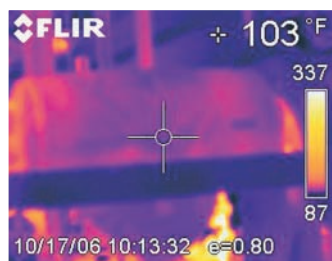
(After) Blanketed Y Strainer "Thermal Imaging Photography"

Thermal Efficiency . . . . . Safety . . . . . Noise Reduction