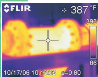
(Before) Bare Y Strainer

Design: LT450TT - 1.5" thickness (white PTFE) Fastener: Velcro Flaps / Stainless Steel Wiretwists